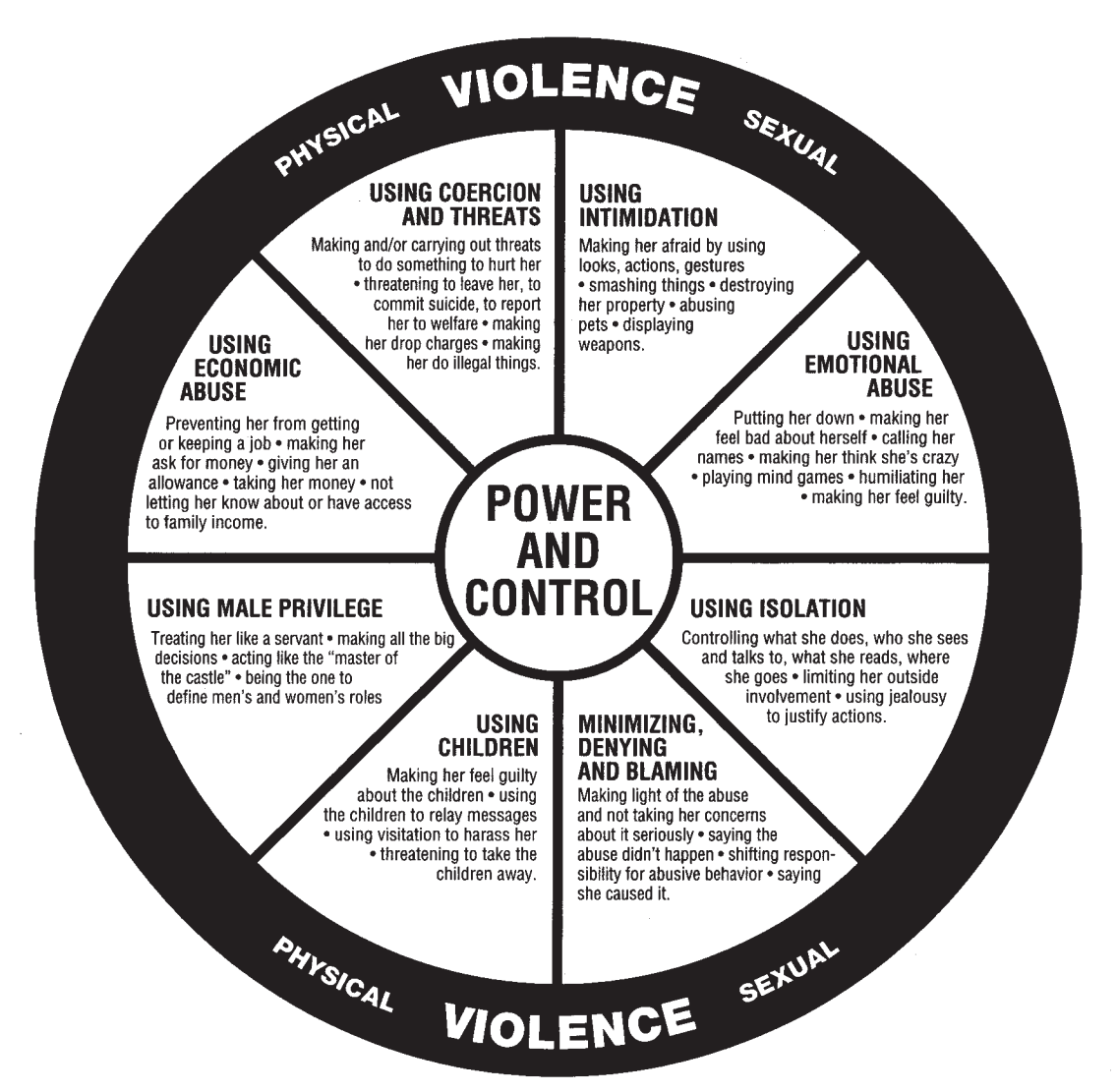
Figure 10-1. Wheel of Power and Control. From Domestic Abuse Intervention Project, Duluth MN, Used by permission.

iological progression of battering that traps the victim.33 Many women are drawn to men who call forth their vulnerability and protectiveness. Men who had difficult childhoods were mistreated emotionally, sexually or physically, or who have drinking problems, often seduce women into feeling sorry for them. Women who respond to this kind of man often had a pattern in their childhood or adolescence of having taken injured animals or pets and nursing them